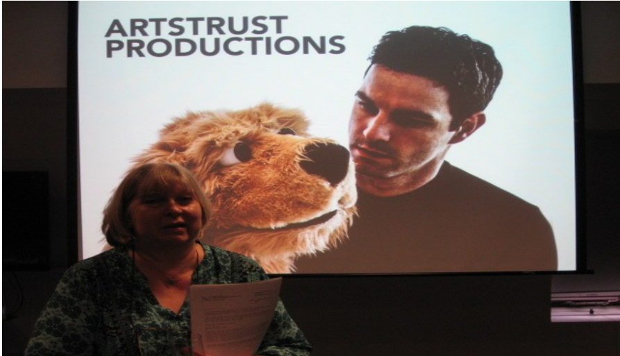
Fun at the Music in Public Libraries Seminar.