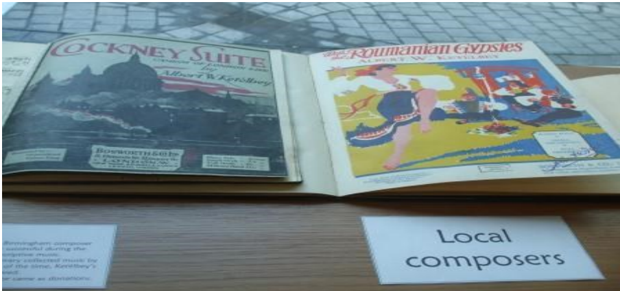
A flavour of the music of Birmingham.

them. It has given the public increased and widened access to resources and has enabled students to take placements/ volunteering and paid roles in mentoring to support their studies in youth or social work.