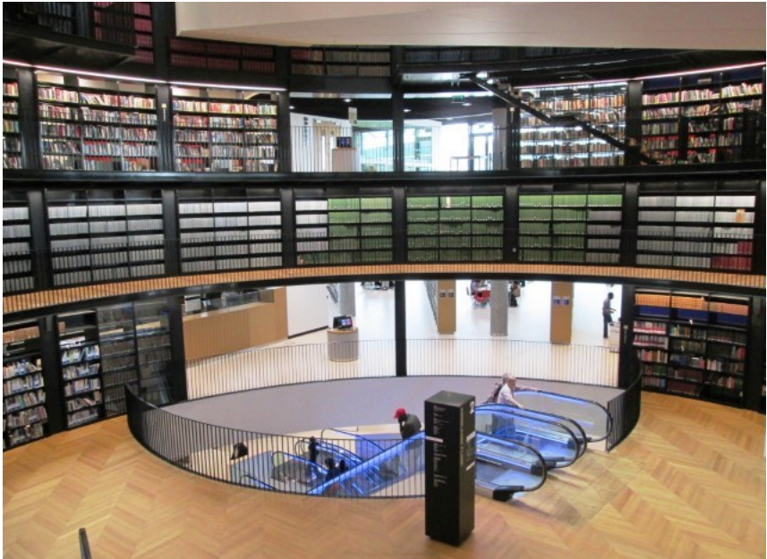
The new library, Birmingham.