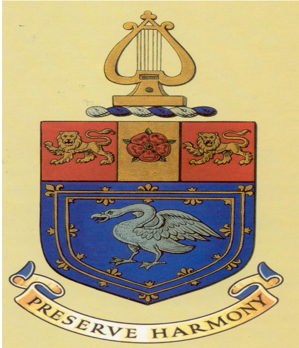
The badge of the Worshipful Company of Musicians

‘Preserve Harmony’ is the appropriate motto of the Worshipful Company of Musicians, one of the City of London’s ancient Guilds, and the only one with a direct connection to the performing arts.