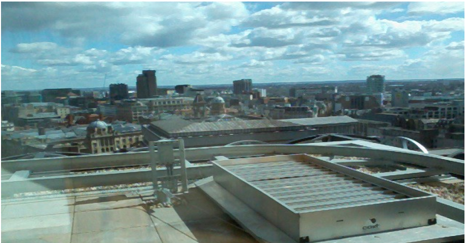
Skyline view from the new Birmingham Library.