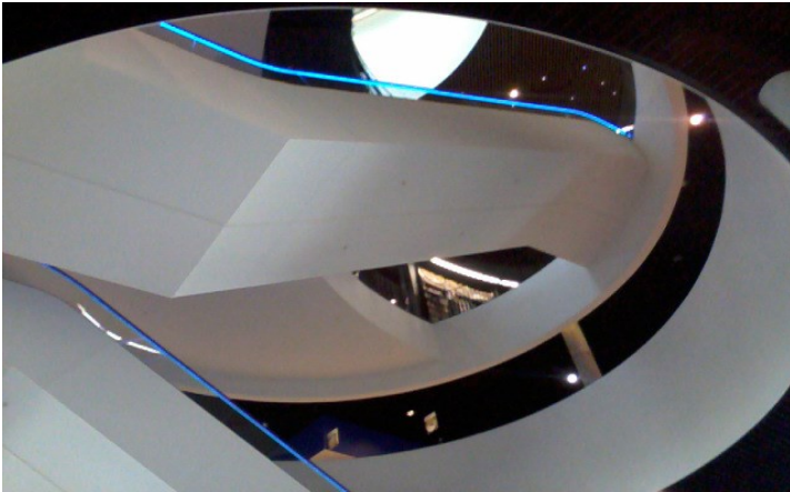
Futuristic new library in Birmingham.