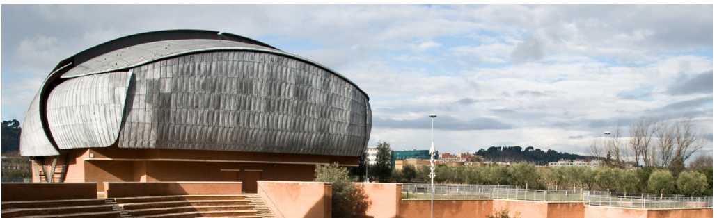
There's no place like Rome.... IAML Congress 2016

For registration and programme information see the Congress website at www.iaml2016.org