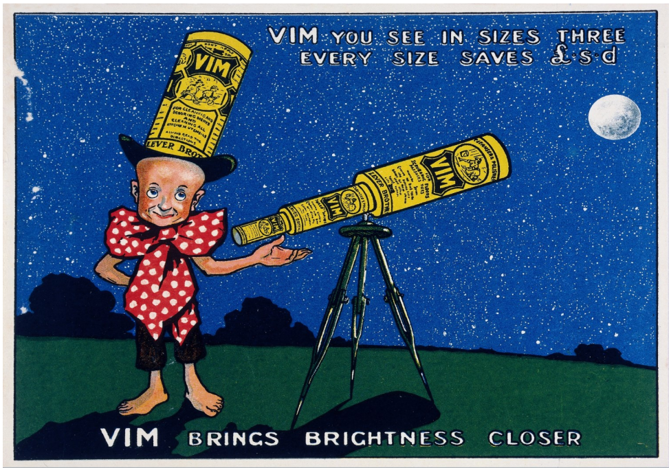
A suitable hat for the President?

The Branch is not large in numerical terms but it does represent an important voice within the library and related communities. I hope I can continue the work of colleagues in ensuring that voice is heard where it needs to be, because music libraries and their services are important. I will be wearing my President's hat when I am involved in Branch business, whether chairing meetings or contacting other people and organisations as a representative of the Branch, but underneath that one will be another I wear all the time – the music librarian's hat.