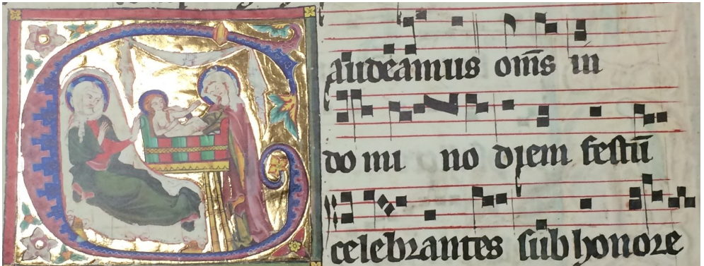
Birth of the Virgin Mary - from an unidentified medieval manuscript

It's double-sided with luxurious capitals. The three pieces of music included on the page are the opening of Missa Herodes Spiculatore , which includes a particularly gruesome illumination illustrating the execution of John the Baptist.