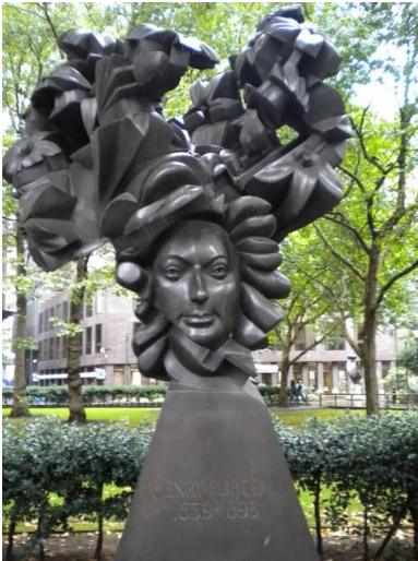
Henry Purcell in Christchurch Gardens, SW1

Next I needed to dream up a project; one that would help residents to connect with their community, make the most of the local opportunities and assets available to them, and encourage them to celebrate Westminster's unique historic heritage.