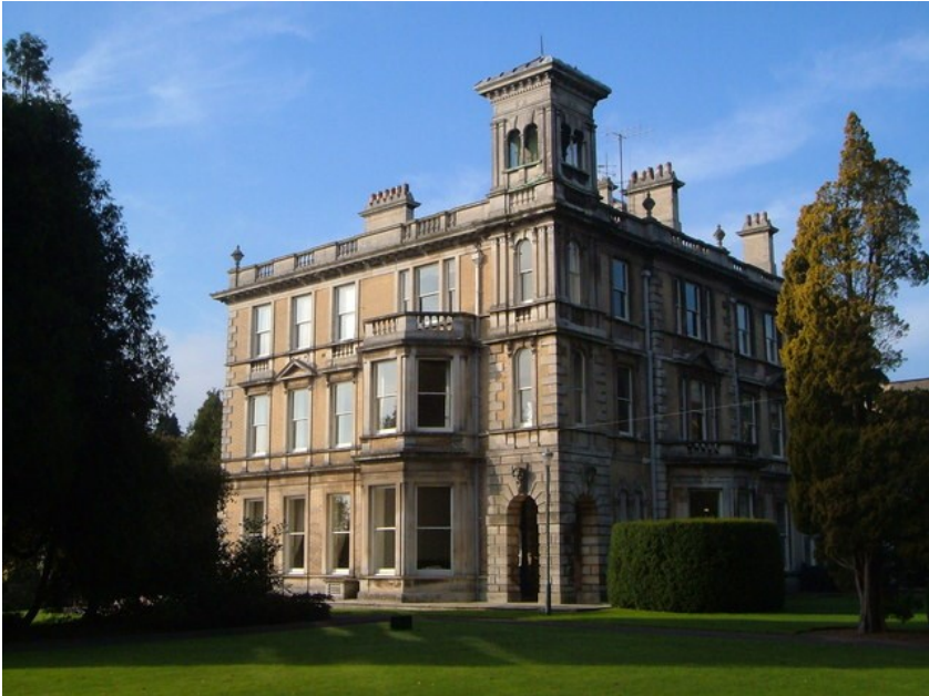
Reed Hall, University of Exeter.