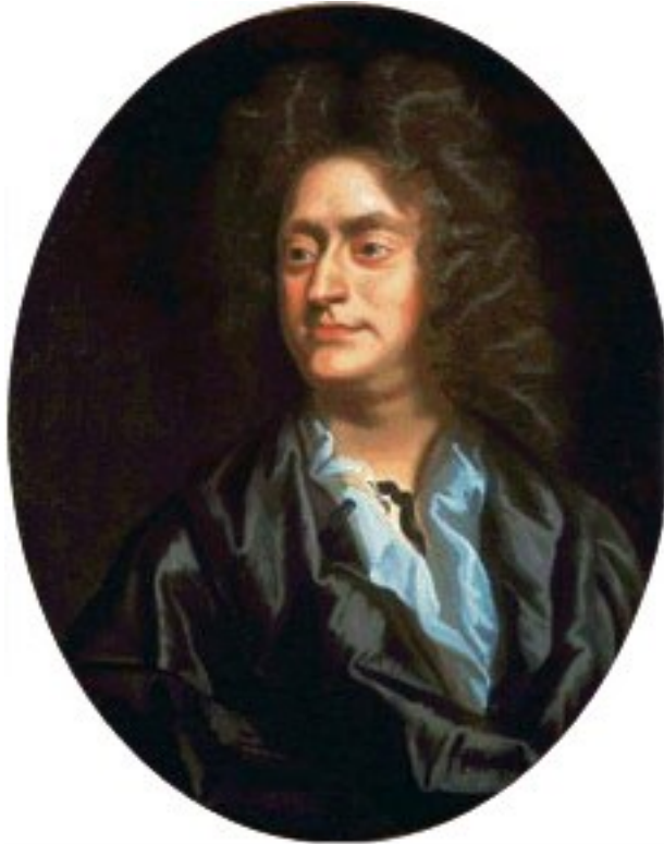
Henry Purcell - portrait by John Closterman