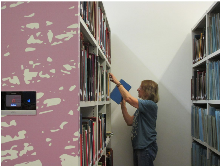
New high-tech rolling stacks at Leeds Central Library

An invaluable resource to local, regional, and national groups; the service offers a wide ranging collection of vocal scores, part songs, and orchestral material as well as music for chamber ensembles and wind bands. The move also means that the music collection has been reunited with the Yorkshire & the Humber Drama Collection and now means Leeds has one of the largest performance set collections in the country.