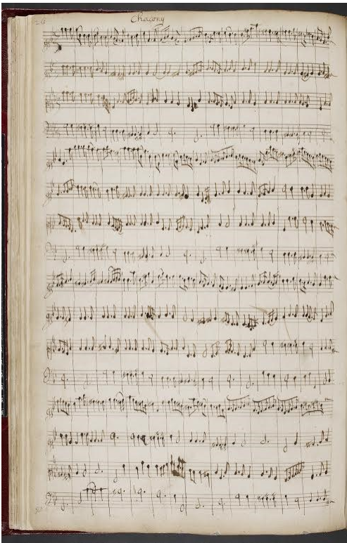
Purcell's Chacony (MSS British Library)

I needed a show stopper, someone who had a real connection to Westminster throughout his life. How about the chap considered to be England's greatest composer of the Baroque era, famously dubbed the "Orpheus Britannicus" for his ability to combine powerful English counterpoint with expressive, flexible, and dramatic word settings? None other than Henry Purcell.